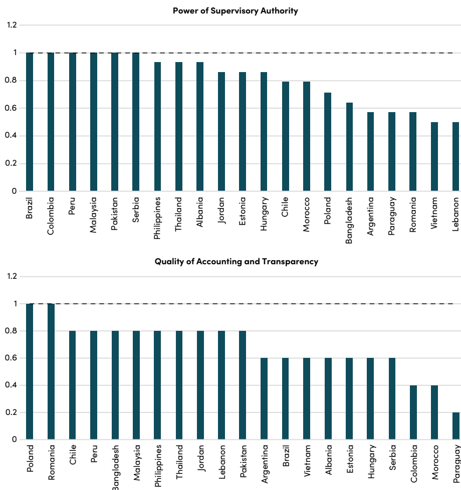
Figure 3. Quality of supervision and accounting and transparency in emerging markets