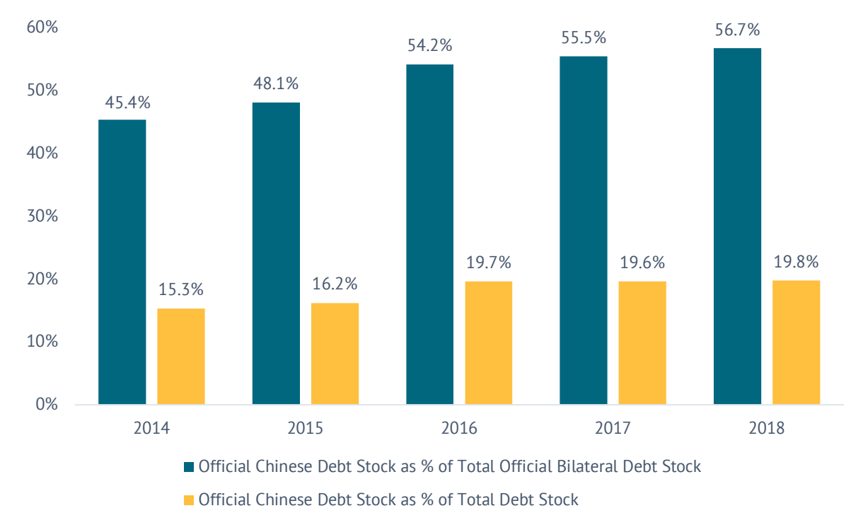
Figure 1. Official Chinese debt stock as percentage of total official bilateral debt stock

Figure 2: Official Chinese debt service as percentage of total official bilateral debt service