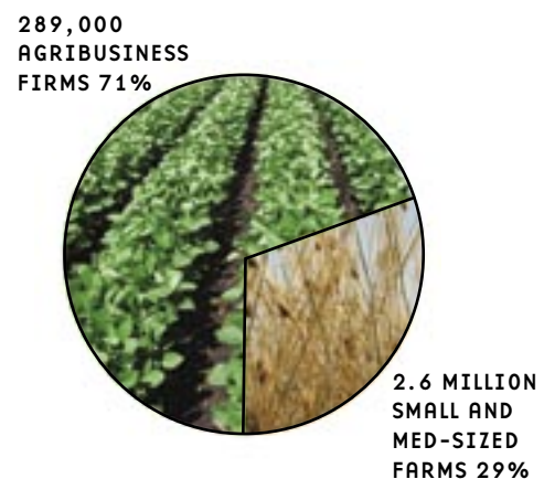
FIGURE 3 U.S. AGRICULTURAL SUBSIDIES: BIG WINNERS DISTRIBUTION OF 1998 – 2003 USDA SUBSIDIES